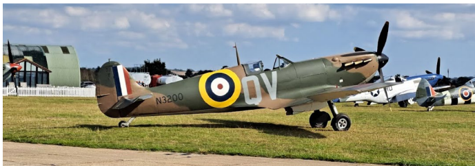
Spitfire Mk I.

Winston Churchill famously said of those days in 1940