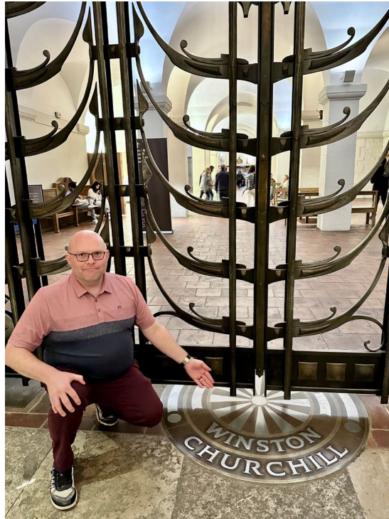
Churchill Gate St. Paul's Cathedral.

Recognizing and fostering talent among our members, the recognition of our speech and debate winners with well-deserved prizes reinforced our belief in the importance of fostering eloquence, civility, and critical thinking. Furthermore, we supported a citizenship ceremony to